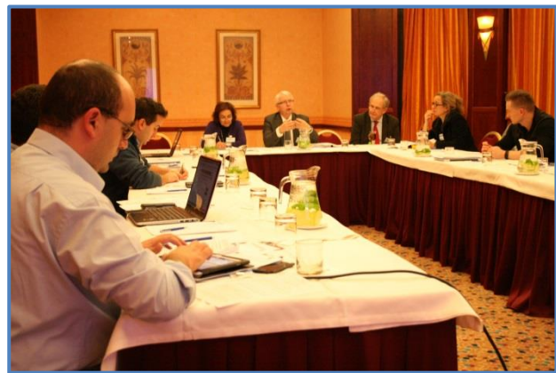
Working Group Session

In order to stop such deterioration processes, the initiative launched by the European Commission Opening Up Education can be an important step to address social inequities in Europe as it aims for making educational resources available for all. Governments need to invest more in ICT infrastructure in education so that all education institutions have sufficient and regularly updated ICT facilities. This is particularly important with regard to creating equal opportunities for students from low income backgrounds and protecting them from dropping out of formal education.