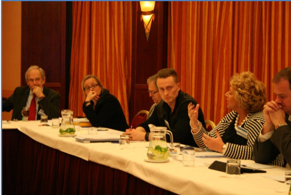
Working Group Session

starting point for teaching to apply new pedagogies and to become more student-centred. In order to succeed, strategic barriers related to funding, pedagogical knowledge, support, and staff training need to be overcome . Initial teacher training should be given priority to support the pedagogic use of ICT. Professional networks can help to exchange best practices and to allow professional development throughout the career.